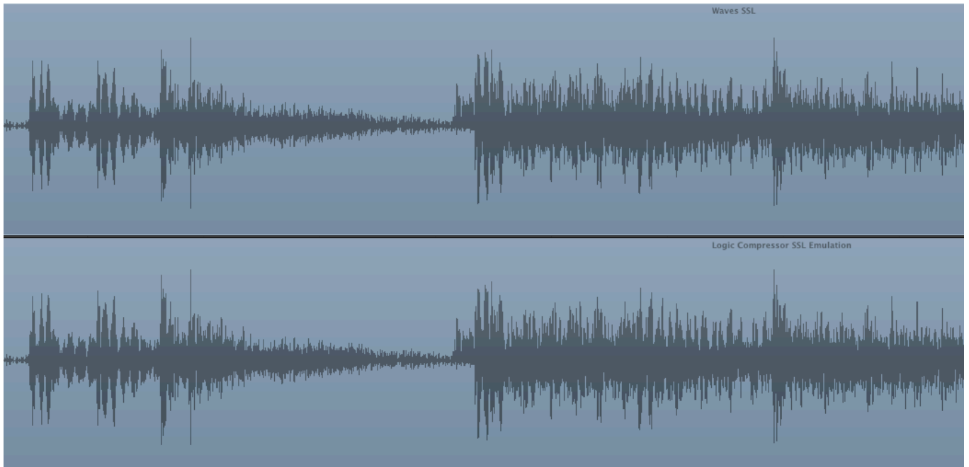
Upper waveform: Waves SSL · Lower waveform: Logic Compressor

This doesn't necessarily mean your ears will agree but the presets are fairly close despite using a bundled sequencer compressor.